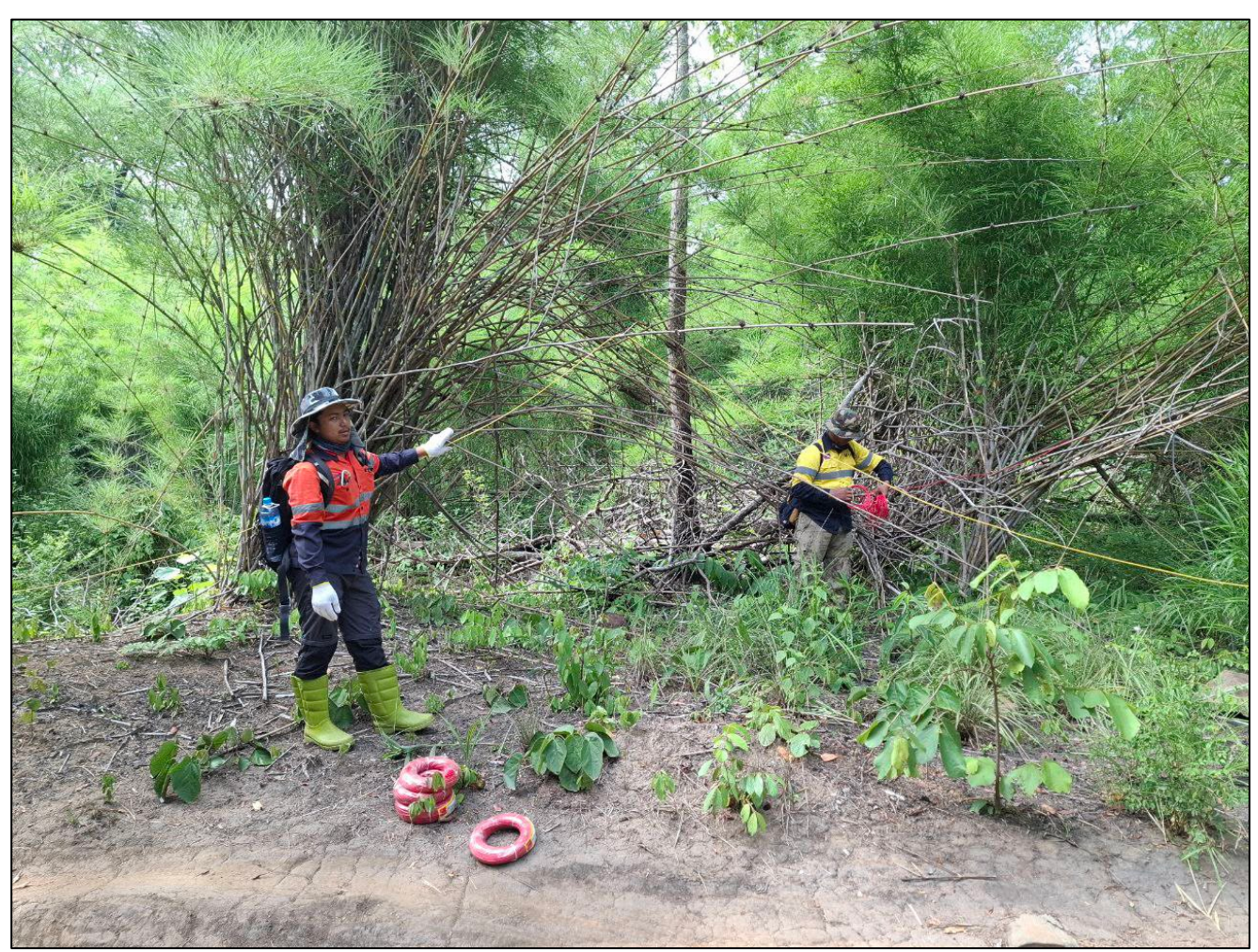
Photograph 1. Rohav Prospect – setting up the Tx wire on Line 1391000N for the dipole-dipole IP survey.