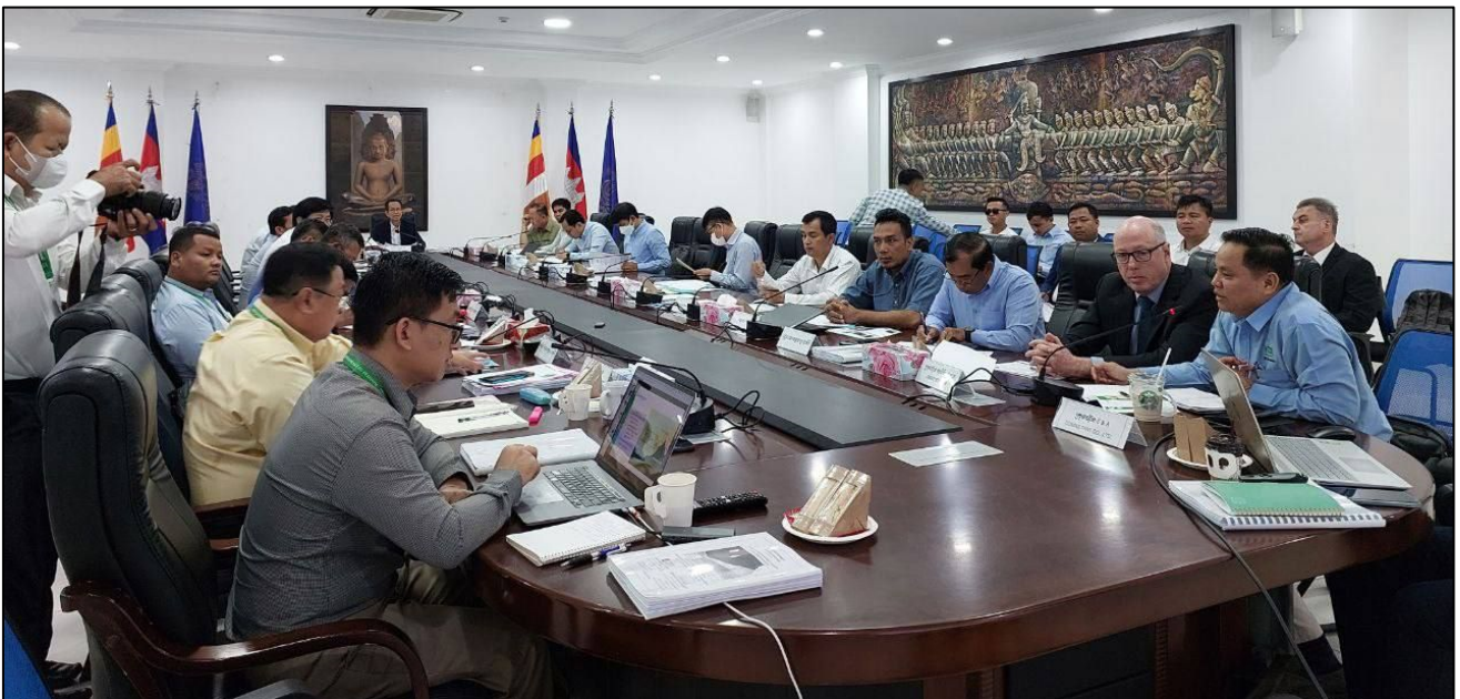
Photo 2. Kingdom of Cambodia Inter-Ministerial Meeting held on 13 June 2023.